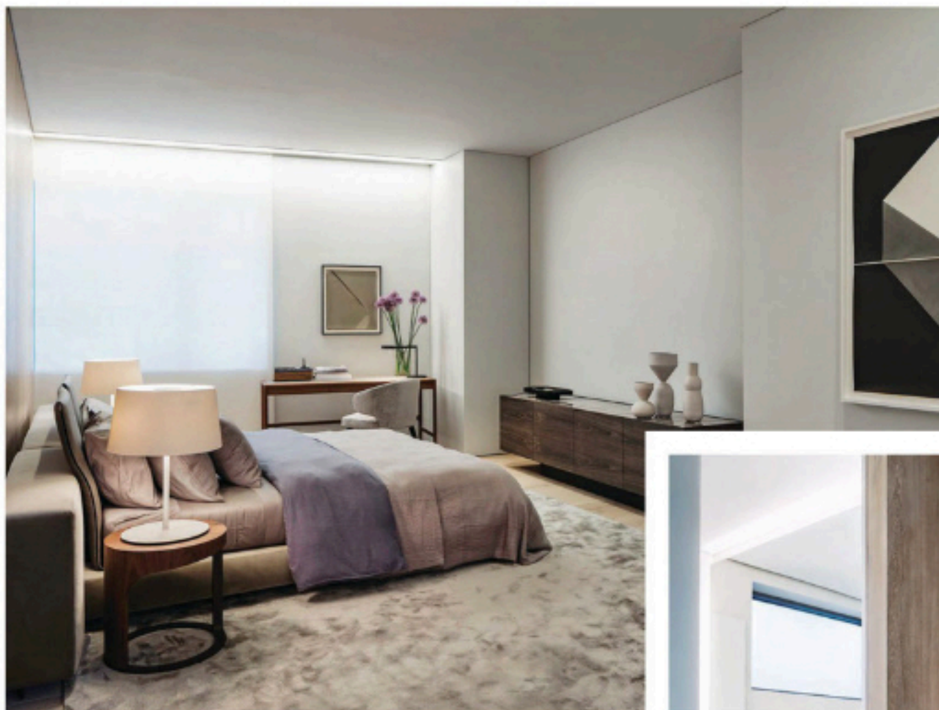
Clockwise from left: The master bedroom, designed on the principles of "simplicity, utility and comfort"; open spaces and pocket doors provide a view into the master bathroom; a seamless tub in the master bathroom rests on a heated floor; eucalyptus kitchen cabinets and Fango marble countertops give the kitchen its earthy, organic feel.